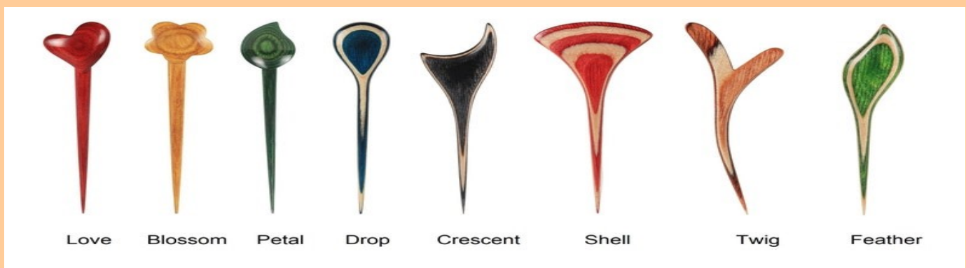
Different Stick Designs