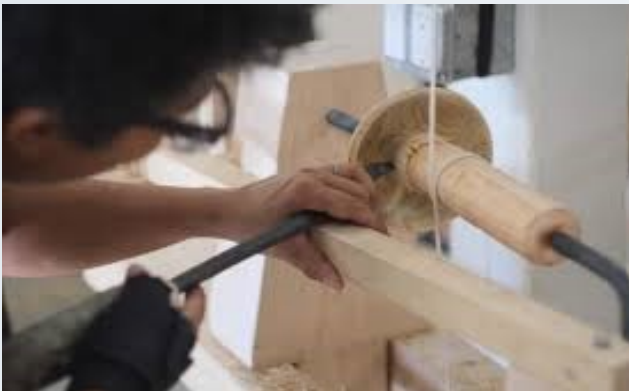
SMALL NUB INSIDE A BOWL